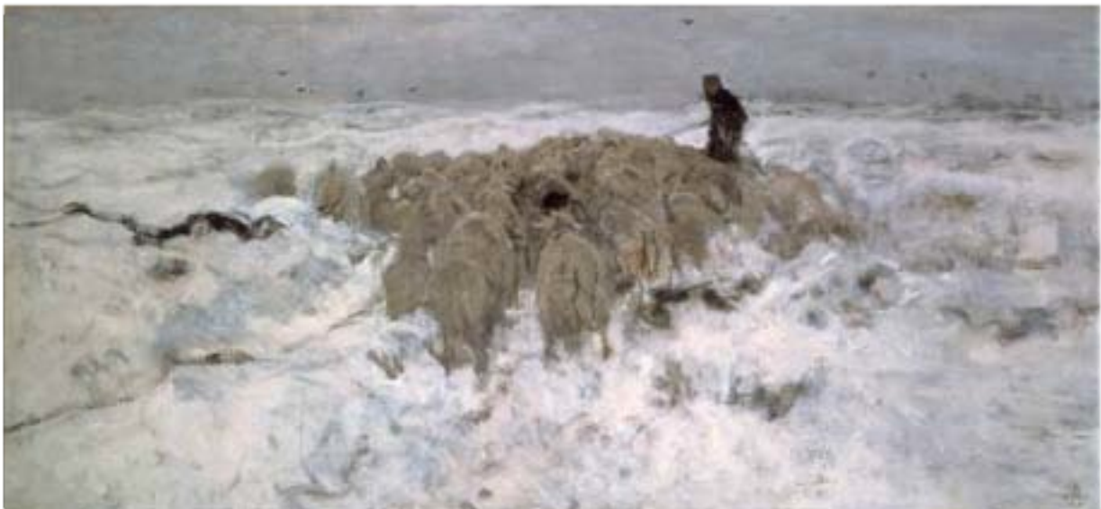
Anton Mauve (1838-1888) Kudde schapen met herder in de sneeuw (Flock of sheep with herder in the snow) 1887 Oil on canvas, 90 x 190 cm Collection: Gemeentemuseum, Den Haag Exhibited: Singer Laren

Please visit their website for further details; www.anton-mauve.nl/pers