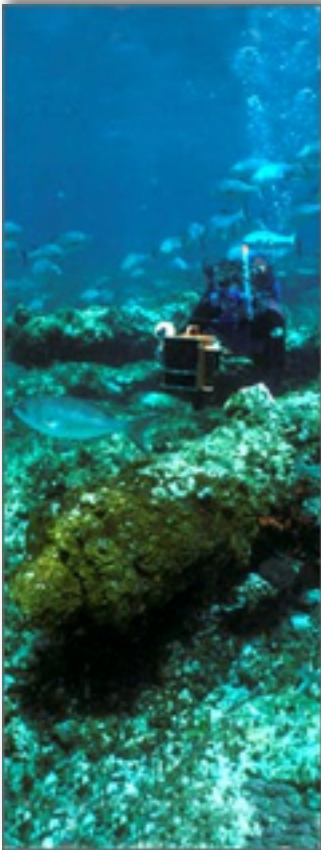
Diving on the Batavia