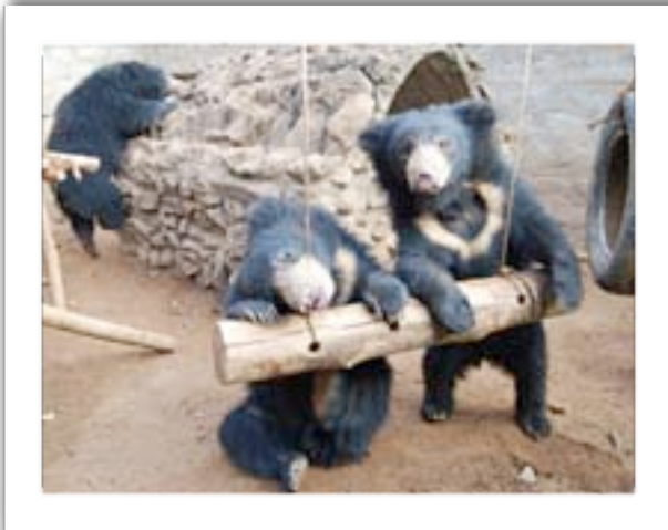
Bear cubs playing in their special enclosure

At this moment we have projects and related Wildlife Connections in both Australia and India and are already in the process of expanding the concept of creating new connections in Africa and other countries in Asia. One of these projects (IN10/0912) is the new Bannerghatta Bear Rescue Facility in Bangalore, India.