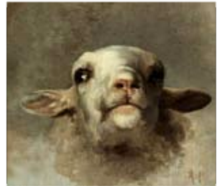
Anton Mauve (1838-1888) Schapenkop (Sheep's head) , 1855-1865 Oil on panel, 17 x 20 cm Private collection Exhibited: Teylers Museum

In 1871 Mauve moved to The Hague where he actively took part in the flourishing art scene. The Hague proved to be the ideal place for a landscape painter like Mauve, with dunes, beaches, fields and woods in the near vicinity. Here he became the famous 'master of the silver light', producing several of the highlights of his career. When he lived in The Hague, Mauve briefly taught his most famous student Vincent van Gogh. There is a special exhibition in the Prints and Drawings Room of Teylers Museum about this unique time of his life.