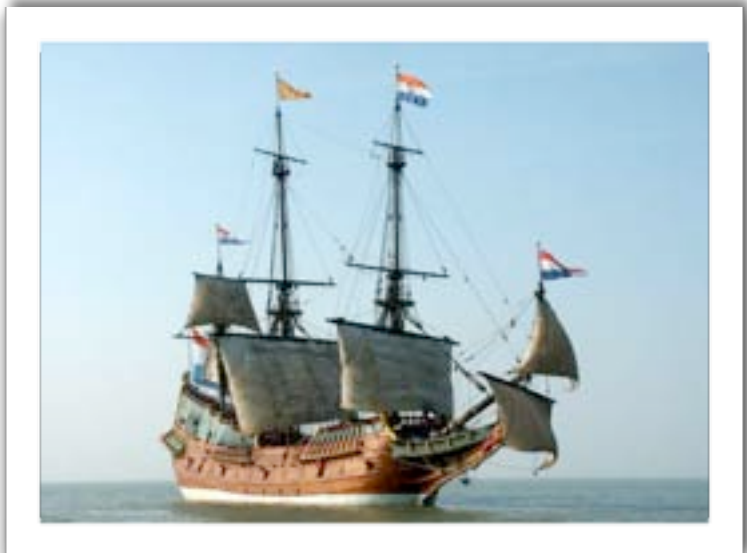
Replica of the Batavia

Subsequently, both the Vergulde Draeck and Batavia were damaged so badly by looters that the WAM decided to excavate them starting in 1972. Later the other shipwrecks followed.